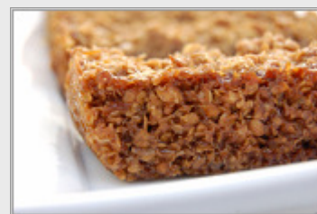
↑ Old-Fashioned Treacle Flapjacks