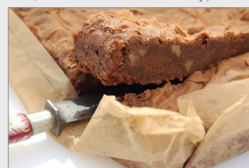
↑ Chocolate Brownies with Walnuts