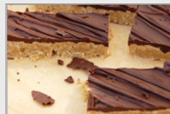
↑ Chocolate & Coconut Flapjacks